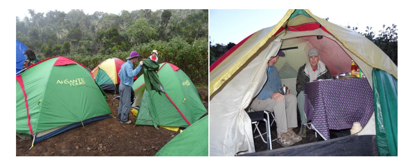
Fig 7 and 8 Each day we hiked to the next designated campsite. The first one was called Machame camp. Elevation was 9280 feet. We had two tents for the three of us. A third tent served as our dining room...it was cramped. Three meals a day were served. Items included broth soup, eggs, bread, fruit, chicken, potatoes, rice, and pasta. We drank lots of tea.

Fig 5 and 6 The trail commenced in a cloud forest. We carried day packs which weighed about 10 pounds. The jungle was mostly empty but we did hear lots of strange bird calls. We did see a Black and White Colobus monkey in the canopy.