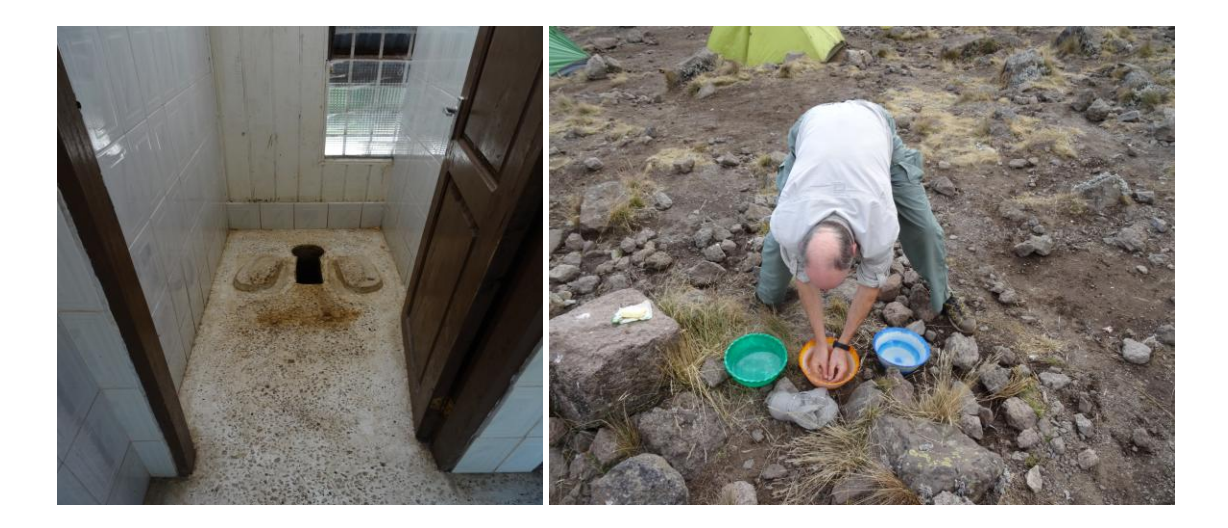
Fig 21 and 22 Day 3 The toilets were just holes in the ground. You squatted on the pedestals and hoped your aim was good! Hot water was supplied in bowels twice a day for hand washing. No showers!

first time. We were now at Barranco Camp, elevation 13,000, where about 100 tents were erected. The tall tents house portable, sit-down toilets. They were reserved for the "expensive" tours. We used the latrines in the permanent structure.