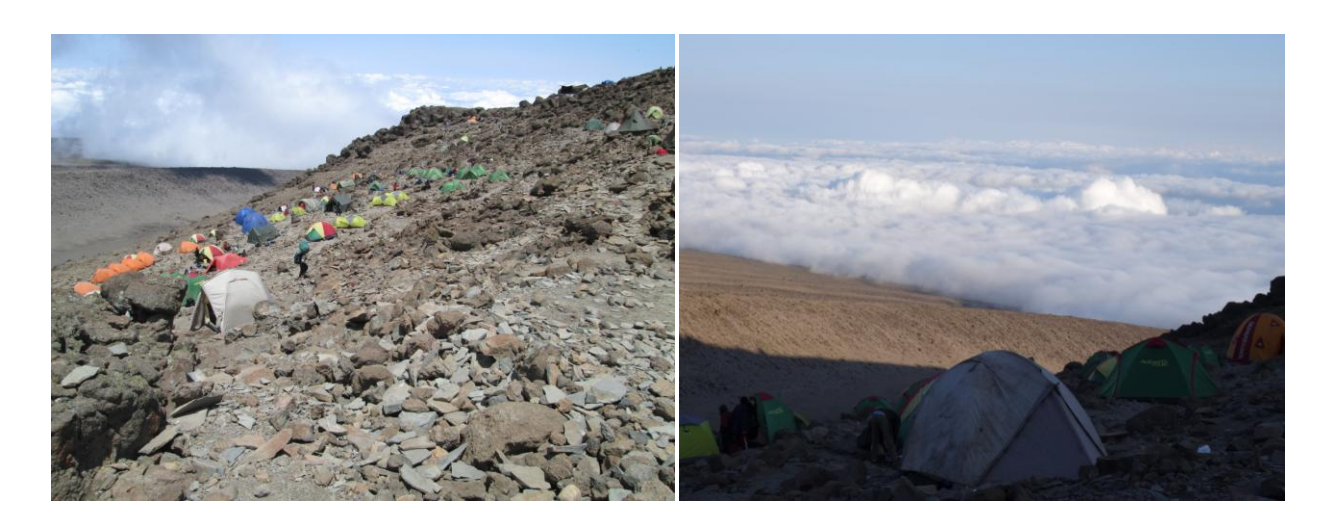
Fig 31 and 32 Day 5 Our final base camp was called Barafu Camp, elevation 15,300 feet. It was situated on a desolate rocky shelf. The final push to the summit consisted of four miles of uphill hiking, gaining 4000 feet in elevation. We went to bed early and our guides woke us up at 11 PM. We left around midnight with the hope of getting to the crater's rim seven hours later to see the sun rise over the "Roof of Africa". It was a night hike under a full moon. It was 20 degrees when we started off, near zero at the top. It was an

Figs 29 and 30 On day 5 we continued our slow, gradual uphill climb, moving more laterally than vertically. The air was cold and the landscape bleak. Far in the distance the top of Mt Meru can be seen, the second highest mountain in Tanzania.