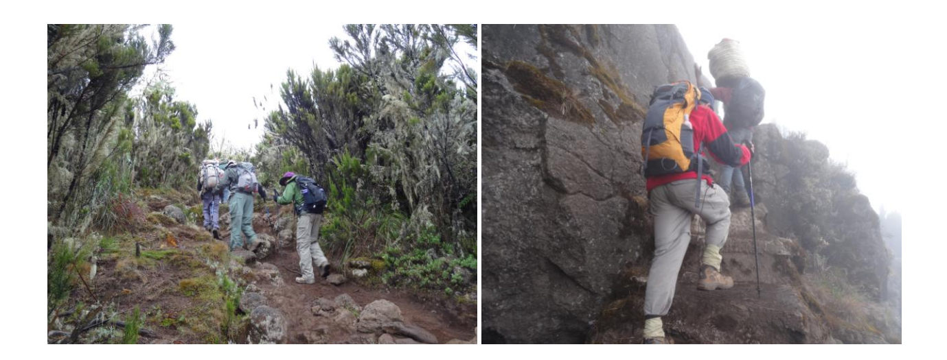
Fig 9 and 10 Day 2 We are now in the zone known as the Heath, climbing steadily uphill. It was another day of fog and drizzle. Notice the porter carrying the heavy basket of supplies on his head.