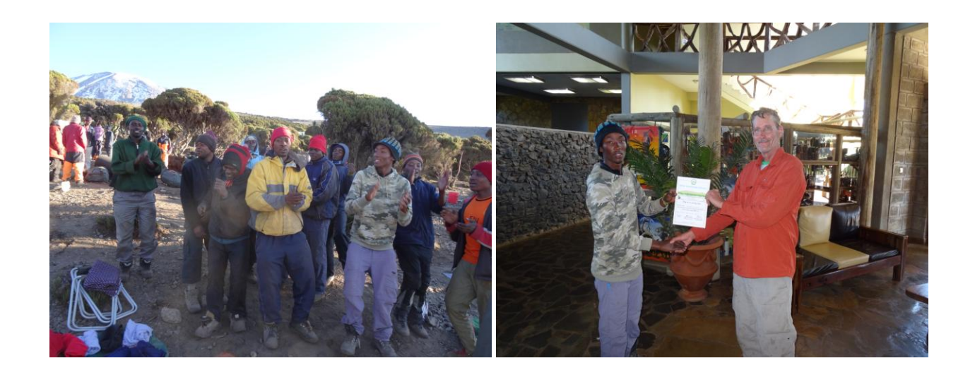
Fig 37 and 38 Days 6 and 7 Millennium Camp...on the way down. It only took 1 1/2 days to descent from the summit to the bottom of the mountain. Our Tanzanian companions sang us a celebration song. One of the traditions at this camp was for the trekkers to donate as much clothing and gear as they'd like, to the porters and guides. The next day I received my official certificate that I had climbed Kilimanjaro and reached Uhuru peak, the highest point.