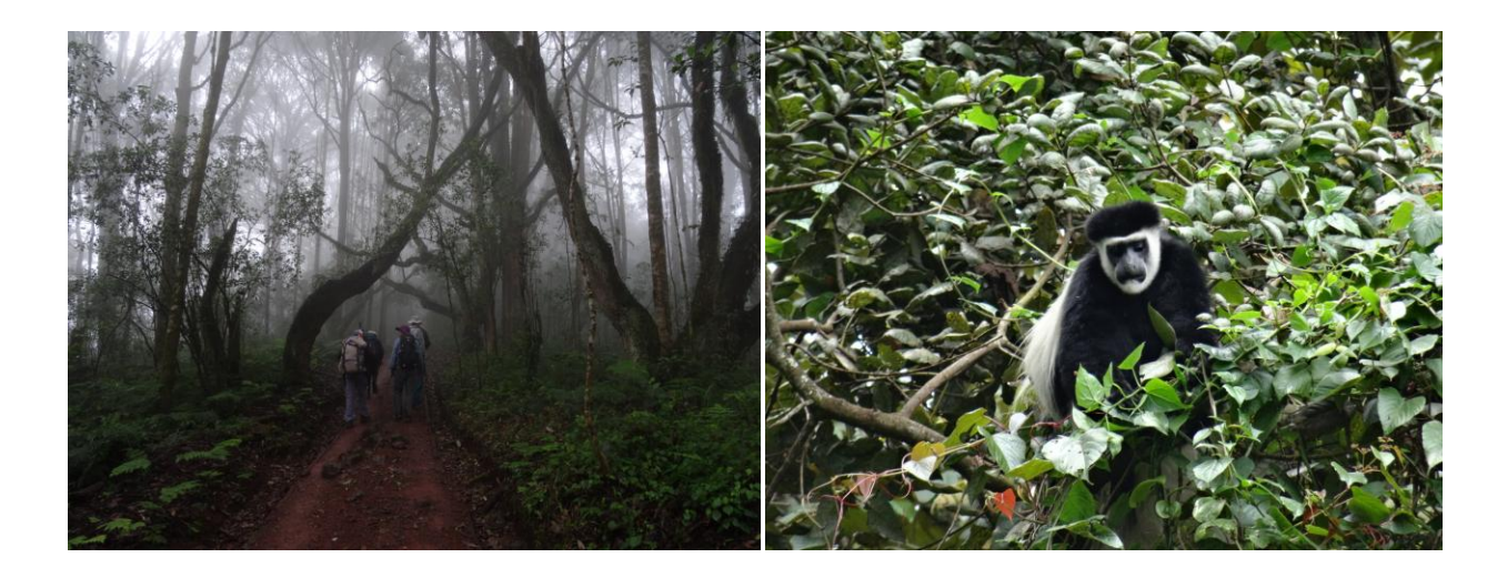
Fig 5 and 6 The trail commenced in a cloud forest. We carried day packs which weighed about 10 pounds. The jungle was mostly empty but we did hear lots of strange bird calls. We did see a Black and White Colobus monkey in the canopy.