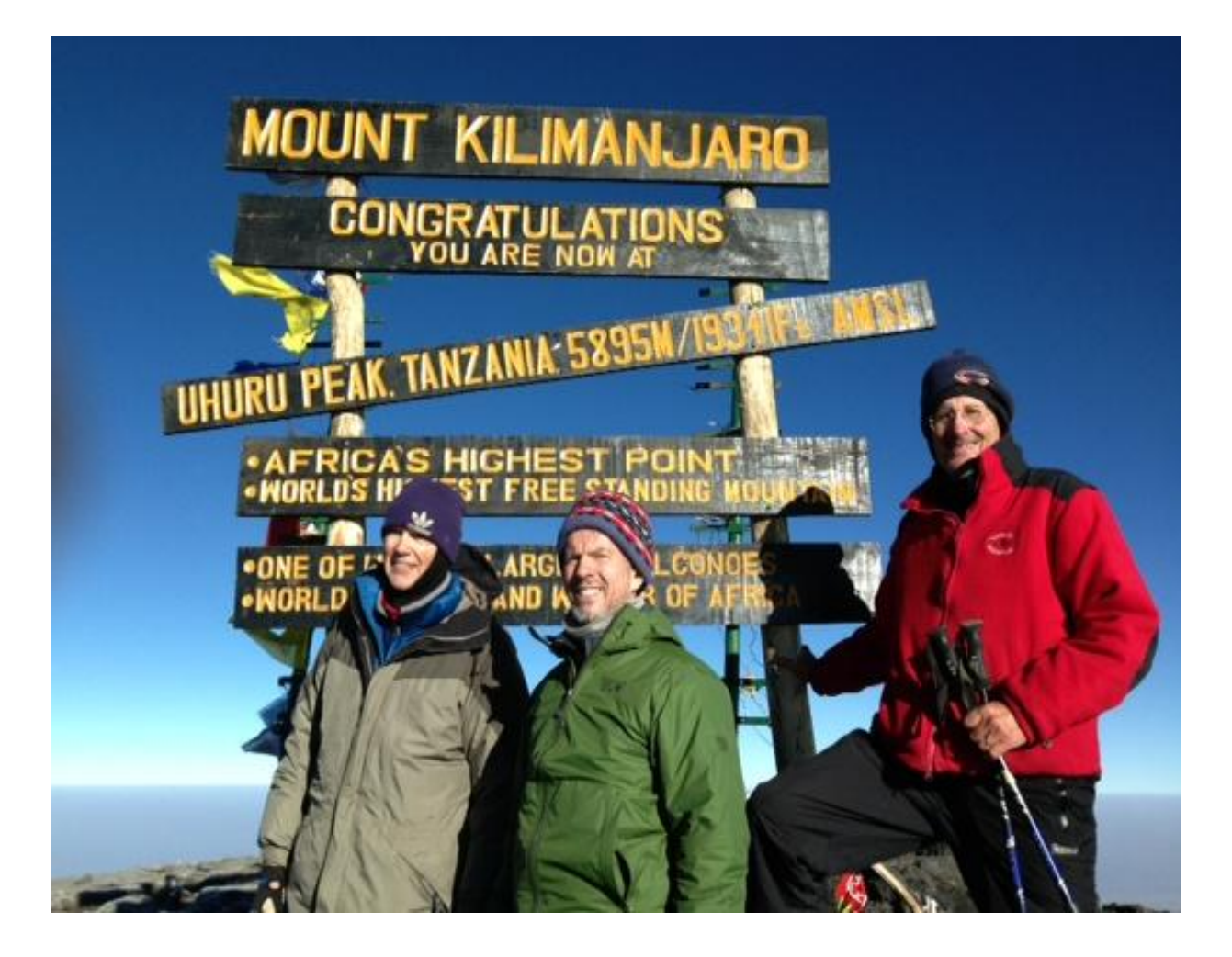
Fig 36 Day 6

Finally...the reason I went...to have my picture taken by the sign at the top! Elevation 19,341 feet. This was the best day of 2014!